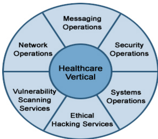
Figure: Technology Span of our Service Offerings

“We remotely manage the world’s largest private network and private MS Exchange 2000 set-up”